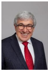
A Letter from Stanley M. Bergman